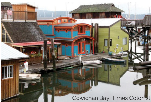
Cowichan Bay